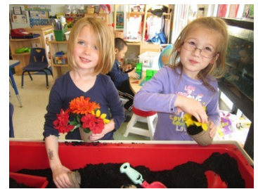
The University Child Care Center